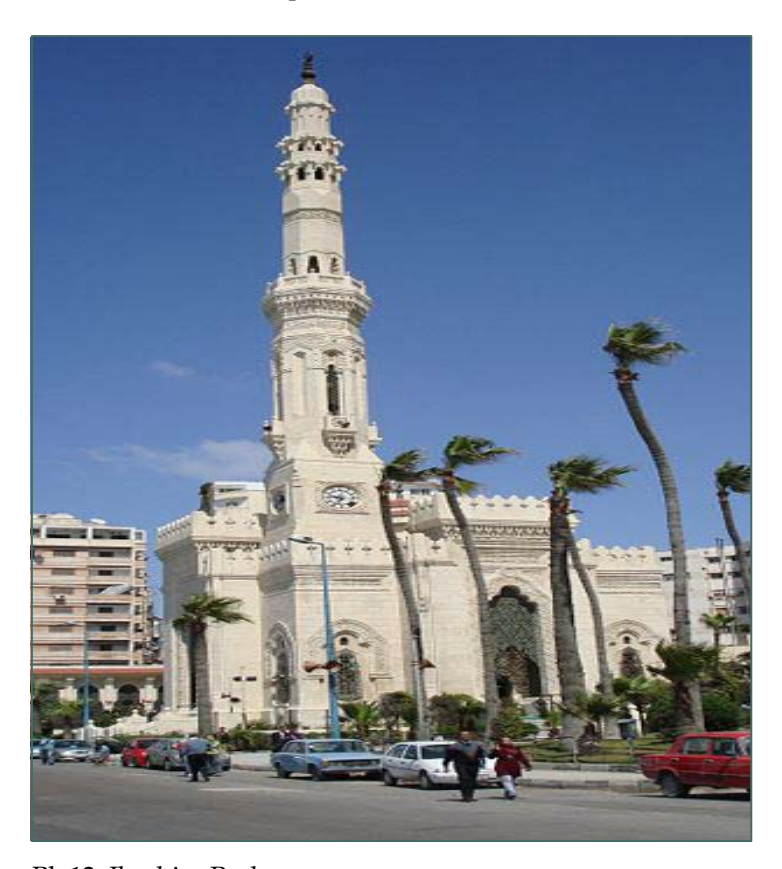
Pl. 12: Ibrahim Pasha mosque

These are just some of many examples of the tangible Italian heritage in Alexandria and the intangible heritage is of no less importance. It includes the Italian cuisine which is famous for pasta and pizza in many restaurants in Alexandria, some of which still have the original Italian recipe of the Italian founder of the restaurant. The Italian music is another intangible aspect of the