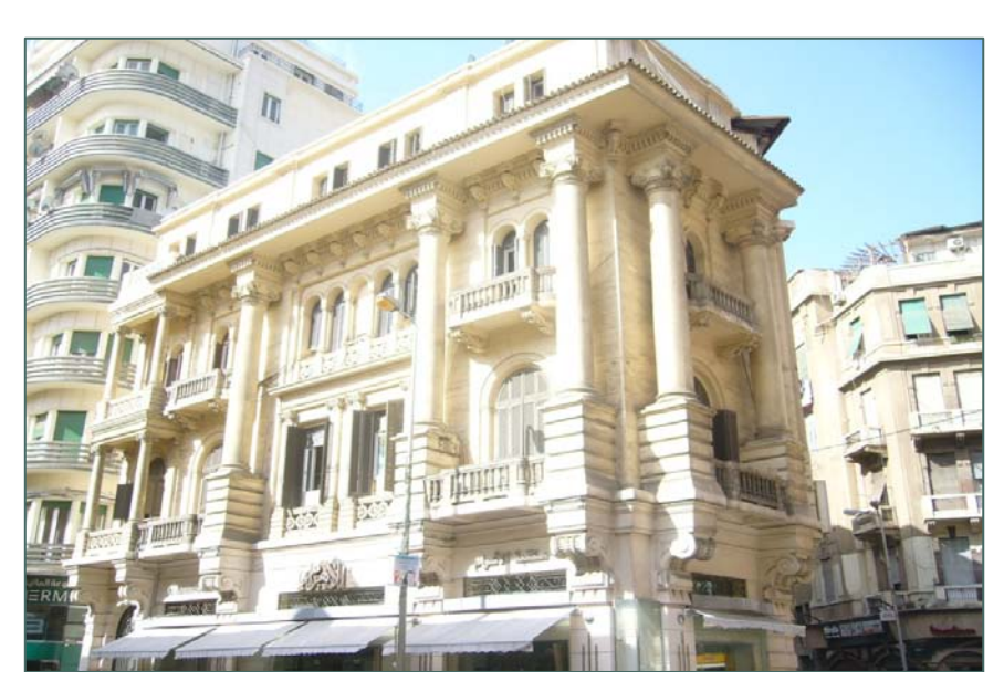
Pl. 5: Palazzino Aghion