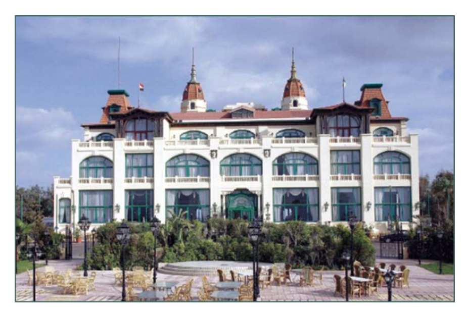
Pl. 7: Haramlek Palace in Montazah