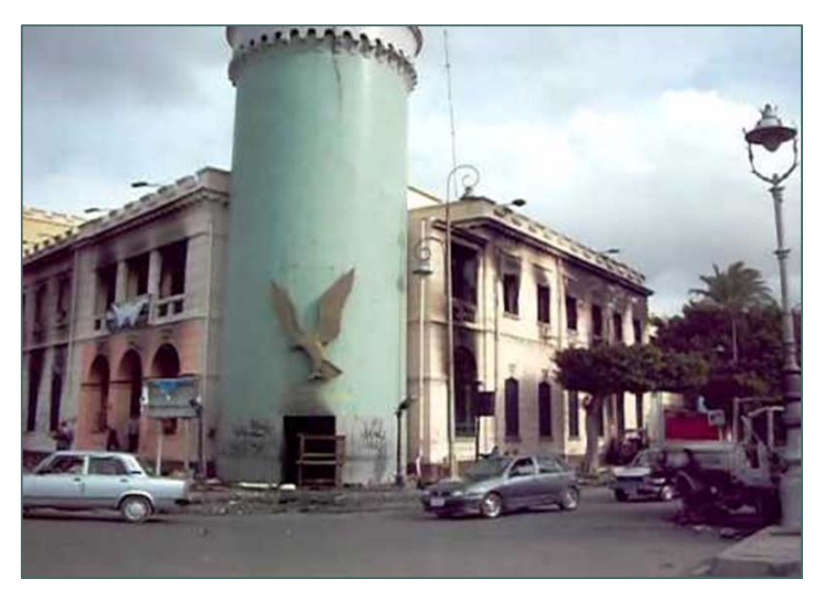
Pl. 6: Police headquarter of Bab Sharki

Although Ernesto Verrucci renovated Ras al-Tin palace and designed Haramlek palace in Montazah (pl. 7), he gained fame from his projects for the Italian community such as building Casa di Vittorio Emmmanuell III before his visit to Egypt and the monument of Ismail il Magnifico (pl. 8) (Pallini, 2005, p. 2, Awad, 2008, p. 184)