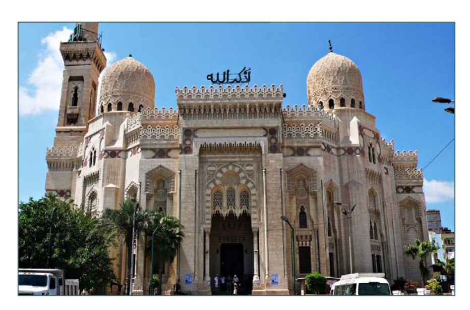
Pl. 11: Abou al-Abbas moasque