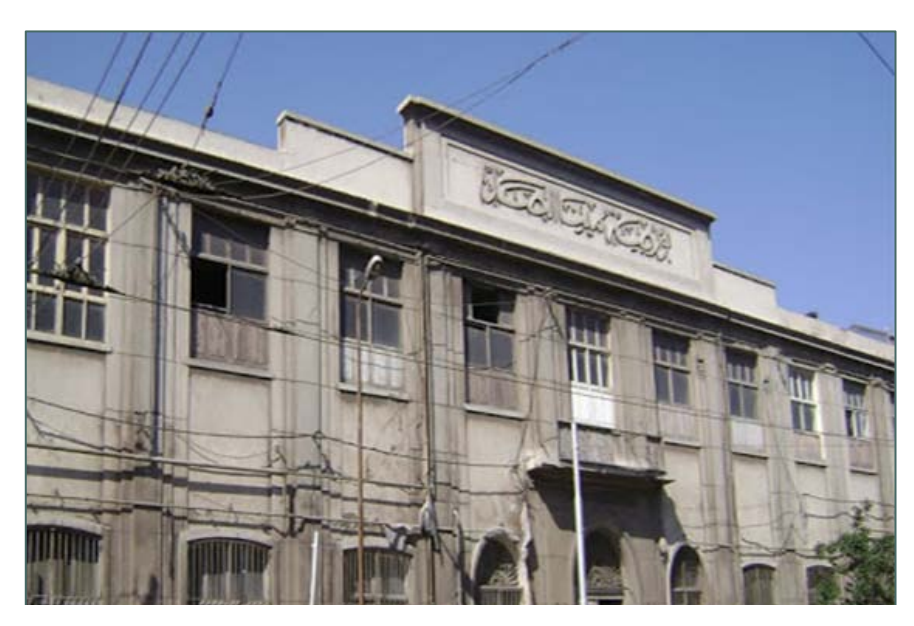
Pl. 2: Boursa of Minet al-Basal

Some of the Italian architects focused on residential architecture such as Filipo Pini who built many houses and villas in the Latin Quarter of Alexandria such as Casa Pini (pl. 3), Palazzino Luzzatto and Sursouk palace (pl. 4) (Awad, 1990, p. 80; Awad, 2008, p. 99). Antonio Lasciac also built many residential buildings in Rue Sherif, Rue Tawfik and Attarin district. Moreover, he designed a building for Karam brothers, a residential building for the Jewish community