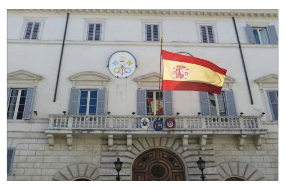
Pl. 3: Casa Pini

in Rue Nabi Danial and Palazzino Aghion (pl. 5) in Rue Rossette in addition to other public buildings such as Ramleh Railway Station (Pallini, 2005, pp. 1-2; Awad, 1990, p. 82; Awad, 2008, p. 112). Similarly, Aldo Marelli built villa Bakr Pasha, villa Karam and villa Binder Nagel in addition to other public buildings for the Municipality of Alexandria such as; the police headquarter of Bab Sharki and the Fire Brigade Station of Kom el-Dekka (pl. 7) (Awad, 1990, p. 82; Awad, 2008, pp. 112-113).