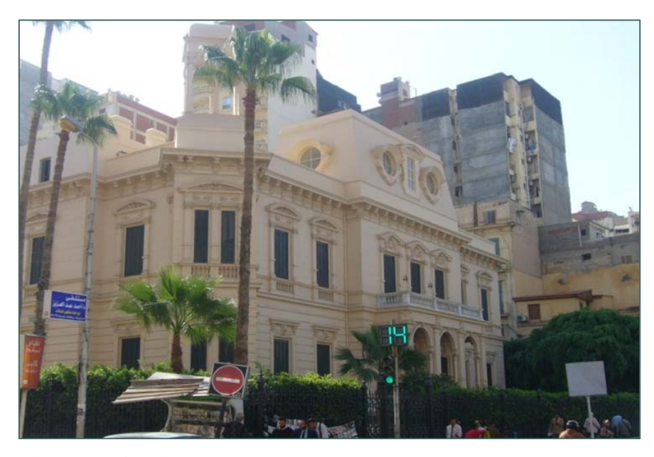
Pl. 4: Sursouk Palace