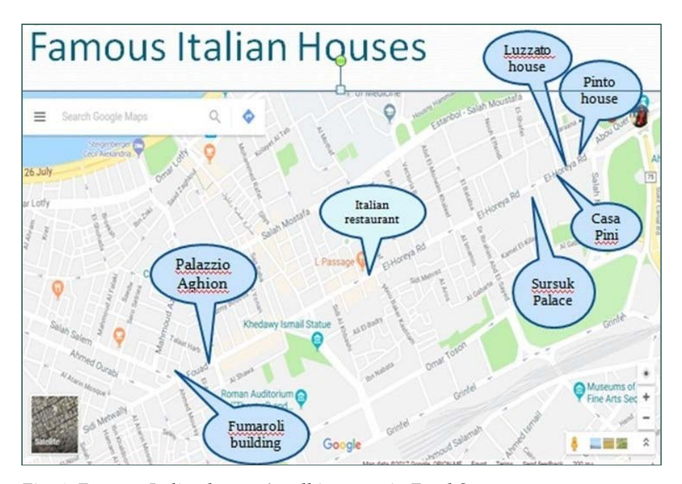
Fig. 1: Famous Italian houses' walking tour in Foad Street

Scheduled walking tours could be organized by tourism companies not only for tourists and foreigners but also for the Egyptians; considering that a variety of tours should be offered to suit the needs of various segments of tourists and locals. Moreover, freelance tour guides can use thematic walking tours to show their creativity in creating innovative themes and providing unique and distinctive tours.