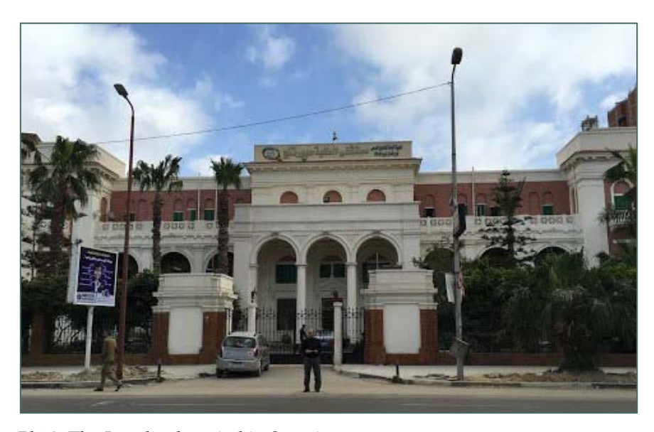
Pl.10: The Israelite hospital in Sporting