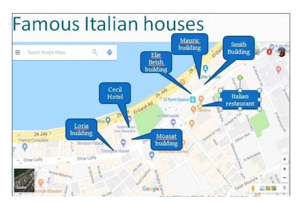
Fig. 1: Famous Italian houses' walking tour in Mahatet al-Raml area